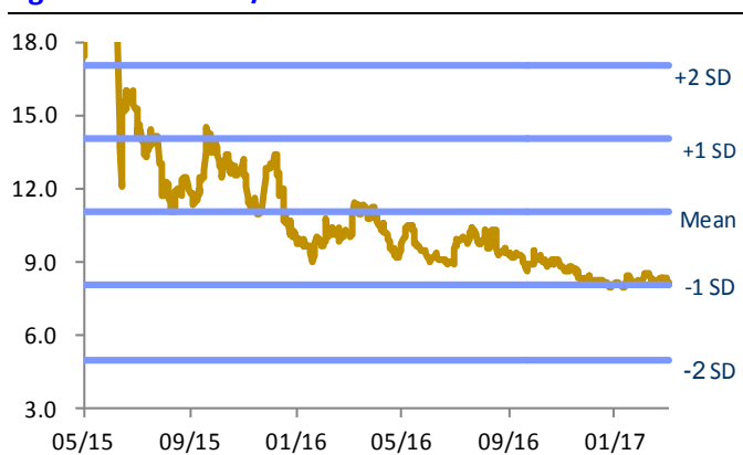
Figure 4: Forward P/E band of YNW